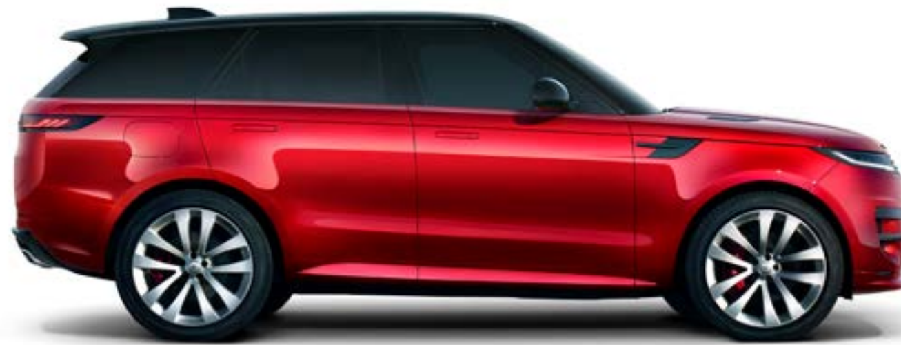
Standard overall length 4.946mm