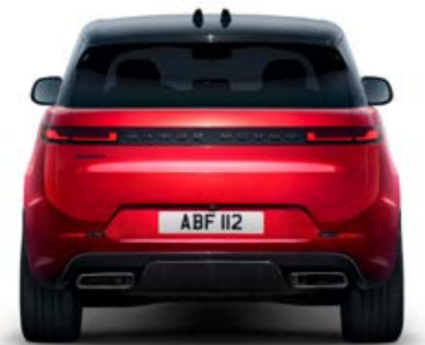
Rear wheel track 1.704mm

Weights and dimensions shown apply to standard-specification, unladen vehicles, which may be affected by optional features and equipment.