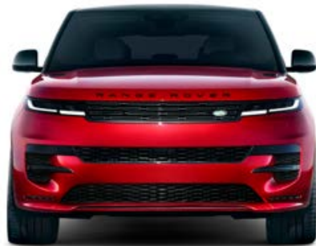
Width 2.047mm mirrors folded Width 2.209mm mirrors out

Maximum loadspace volume behind second row Dry* 647 litres Wet** 835 litres